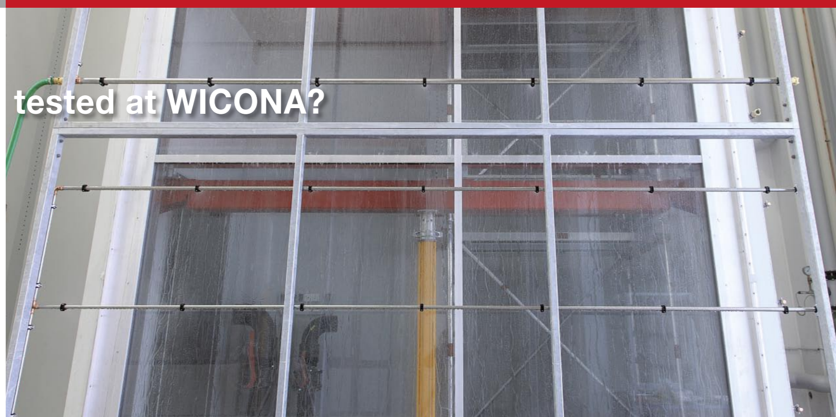
Façade test rigs

The façade test rigs make it possible to perform tests on samples with maximum dimensions of 10 m x 10 m. Customers are able to freely select the dimensions of their test specimens within these limits.