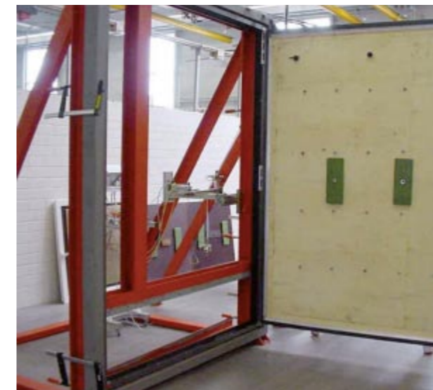
Tension/compression testing machine

Dynamic tests on fittings and elements are carried out on doors and windows up to a height of 4 m. For example, continuous operational testing in accordance with EN 1191 and testing of fittings for windows and French doors, requirements and test procedures for turn/tilt and turn and tilt fittings in accordance with EN 13126-8 can be carried out. Sash widths of up to 1550 mm can be tested.