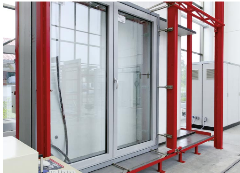
Window test rig

The rig is designed for windows, doors, fixed panels and combinations.